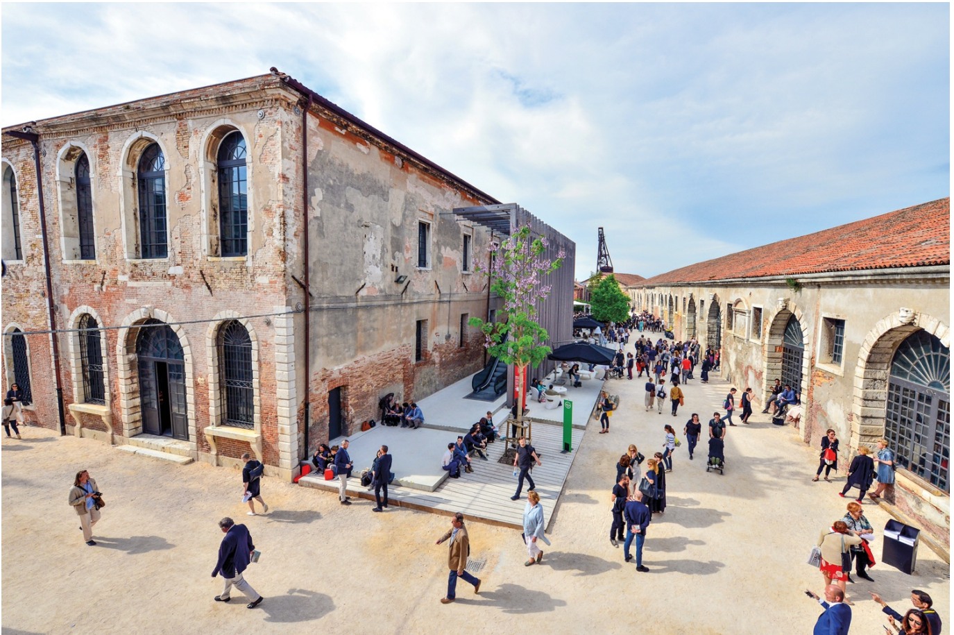
Venice's Arsenale shipyard hosts works by contemporary artists during the biennial.

The citywide event, taking place May 11 to November 24, encompasses curated exhibitions in the national pavilions along the verdant alleyways of the Giardini, Venice's public gardens, and related shows in the Arsenale shipyards, whose 12th-century industrial bones serve as a magnificent setting for contemporary art. Additionally, visitors can see incredible works at pop-up displays inside centuries-old churches, on the lagoon's neighboring islands, and in palazzi flanking the Grand Canal.