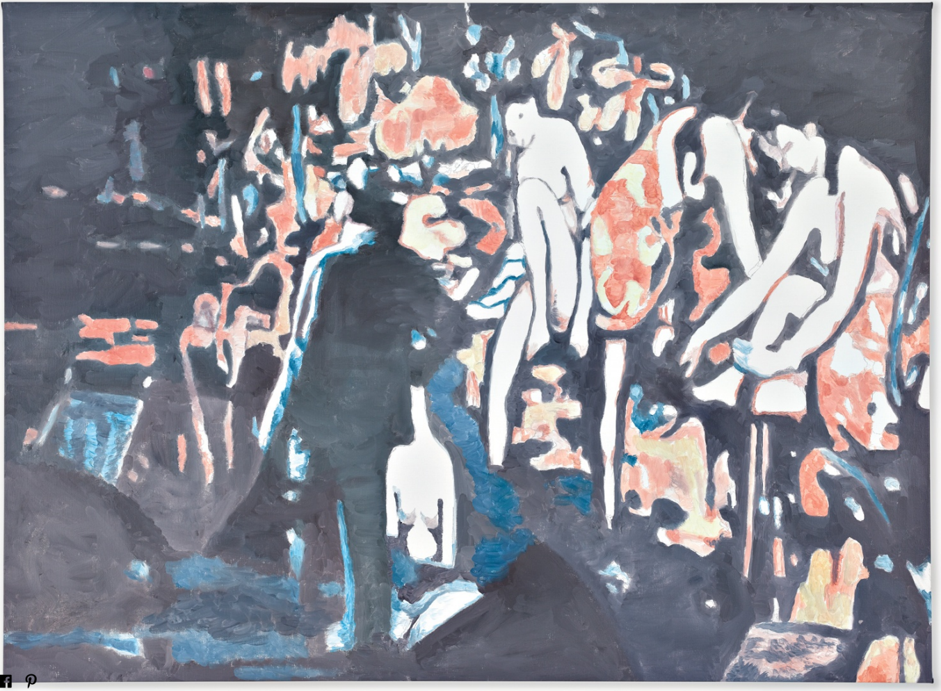
Luc Tuymans, Allo! I , 2012.