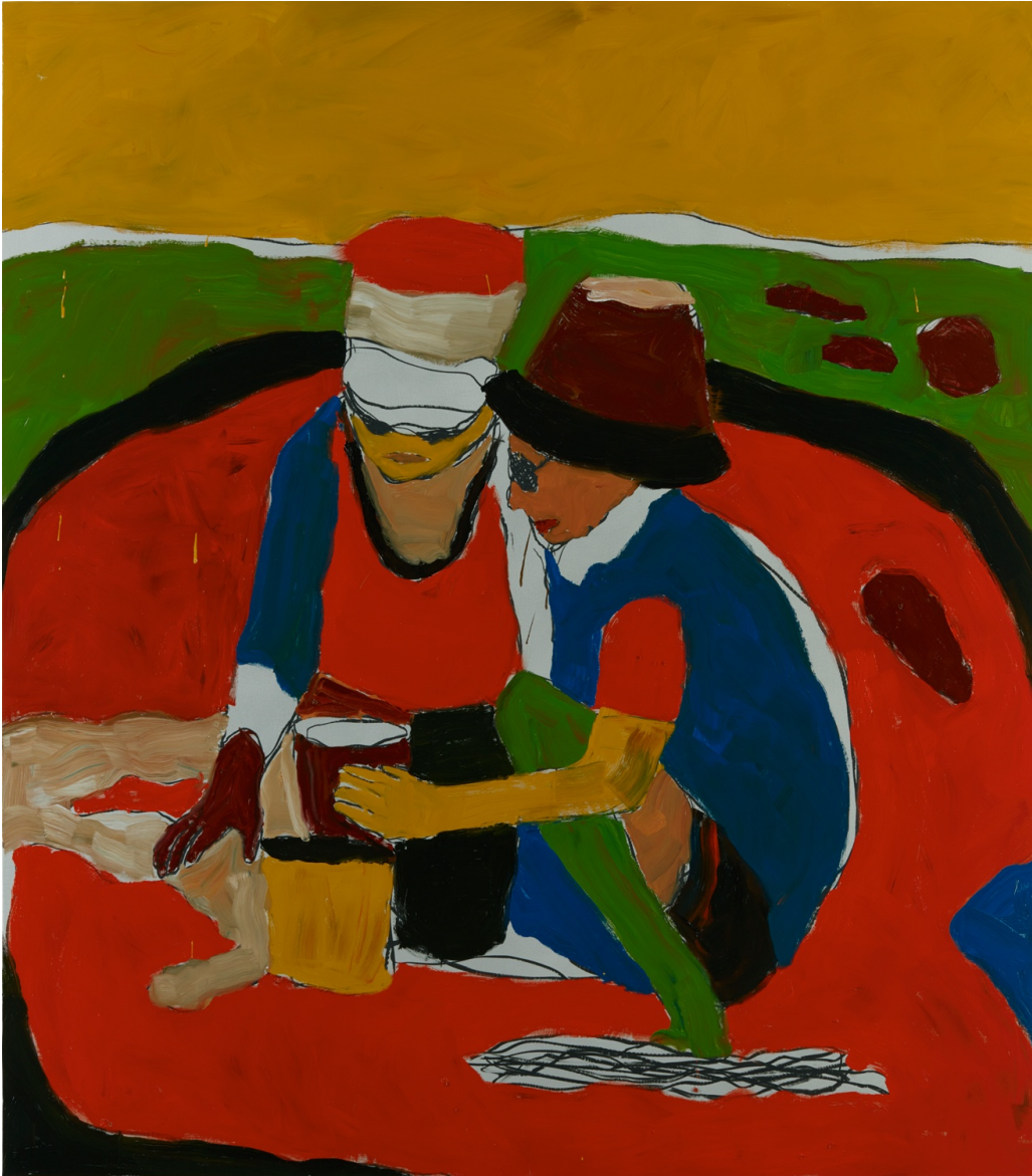
Sean Scully, Madonna Triptych (one panel of three), 2019.

Recommended: Inside the New Valmont Art Foundation in Venice